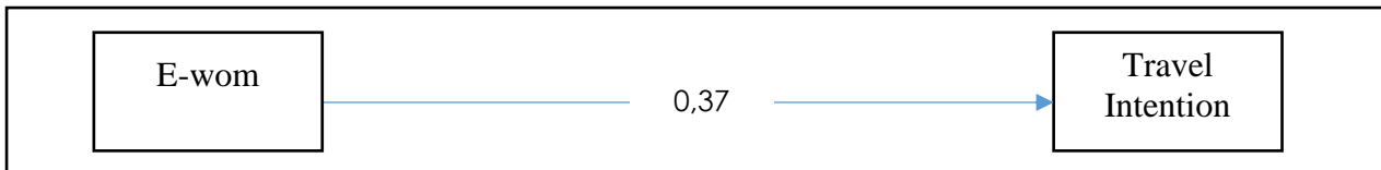
Figure 2 Model 1 Test Results

To test the relationship, the first structural model was run to measure the effect of the independent variable on the dependent variable. The results gave good goodness of fit values. ( \chi^2 = 49,079 , \chi^2 / \text{df ratio } 1.963 , p = 0.003 ), the GFI value 0.974, RMSEA value 0.04, and CFI value 0.988 indicate that the model is satisfactory (Schermmelleh-Engel, Moosbrugger and Müller, 2003). Figure 2 and Table 5 show the relationship between E-WOM and Travel intention ( p = 0.000 ).